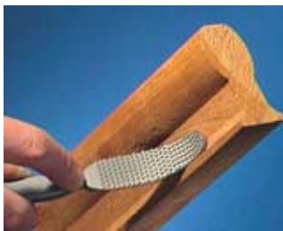
Files and rasps for wood